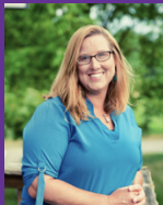
Dawn Koch Museum Educator